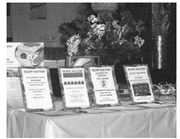
Left and center: Layton Octoberfest. Far right: Brian Falzon Memorial Road Rally