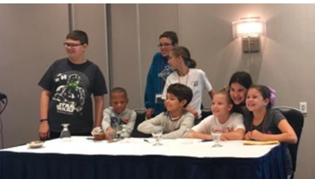
SADS Kids at 2017 Conference