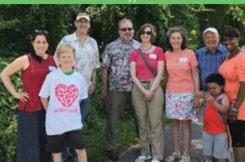
SADS Family Members at the Baltimore and DC Area Support Picnic

The Timothy Syndrome Alliance continued to expand and the CPVT support group met for the first time and is moving forward in establishing their goals.