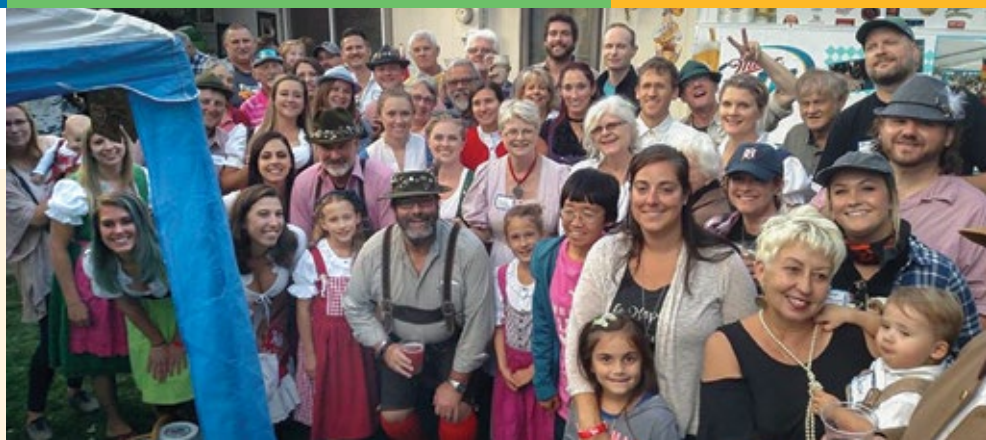
20th Hanss Layton Oktoberfest! (below)

Nearly 2,000 phone calls or emails were completed in service of SADS families.