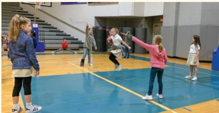
Shelton School, Dallas jumpers during February 2020 Bryan Price Memorial Jump-a-thon